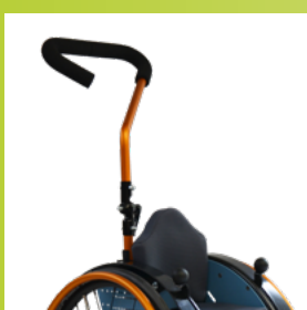
one hand push handles