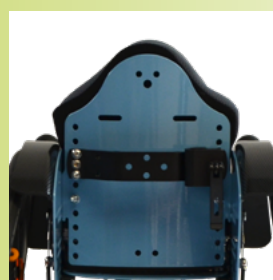
back unit without back tubes