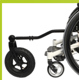
outdoor front end

All equipment options are on the order form of the corresponding wheelchair