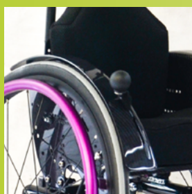
brake integrated into the clothing guard side parts