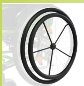
double hand rim