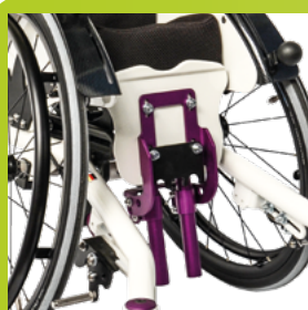
leg support folds back